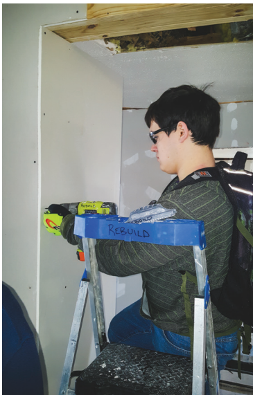
▲ A student volunteer in Texas for his senior class trip.

“Instead of making class trip an inherently selfish venture, I wanted to reach the unreached and touch the untouched.”