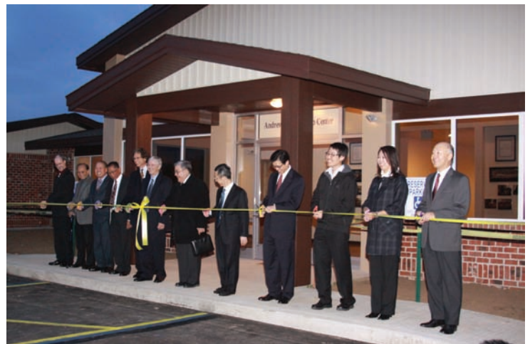
Leaders from various organizations at the ribbon cutting ceremony

Following the service, the audience was invited to a ribbon cutting ceremony in front of the Discipleship Center. Leaders and members from both churches, as well as conference officials, cut the ribbon together and opened the building for a grand celebration which included self-guided tours and an abundance of delightful cuisine from both the Filipino-American and Korean-American cultures.