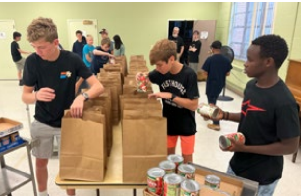
Above: Roughly 30 teens read to children, built beds, baked cookies, and filled food baskets during this year's Vacation Bible School.