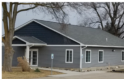
The new Grand Blanc church

“I know you! You’re the preacher from those wonderful Unlock Revelation meetings with billboards all over Michigan!”