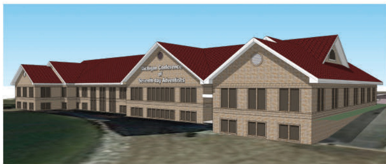
Conference Office view from Northeast

this sound advice. The last half of 2015 was spent working with the architect and our staff on the plans. The architect visited with each department individually, in addition to working with the officers.