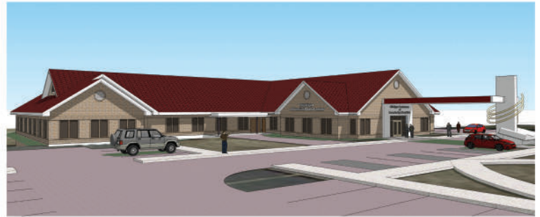
Conference Office view from the northwest

must legally meet at least once a year and is comprised of three groups: the Lay Advisory Coordinating Committee comprised of 15 laypeople elected by the Annual Lay Advisory; the Michigan Conference Executive Committee elected by the large Constituency; and the District Superintendents.