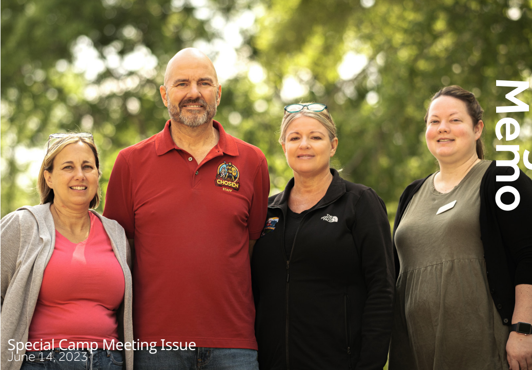
Special Camp Meeting Issue June 14, 2023

(Produced by the Michigan Conference Communication Dept.)