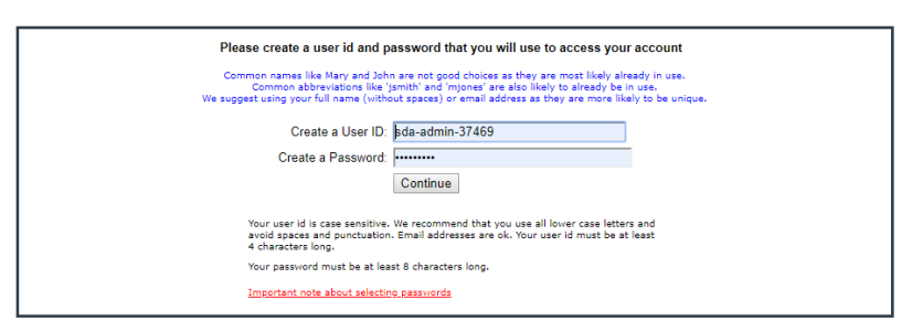
Already have an account?